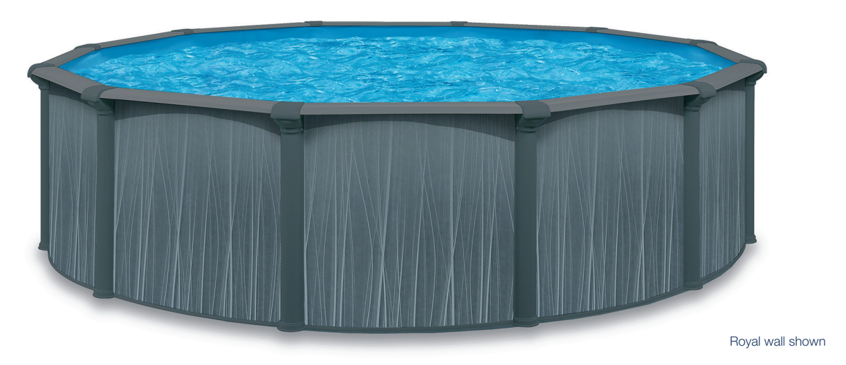
Rounds | 52" 12' 15' 18' 21' 24' 27'