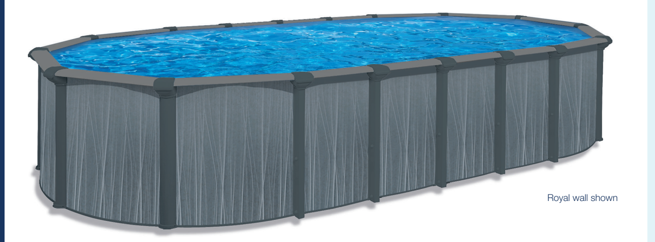
NBS Ovals | 52" // A-frame Ovals | 52" 12'x18' 12'x24' 16'x26' 16'x32' 18'x33' 18'x38' 18'x44'