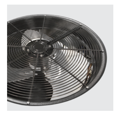
Large, quiet ventilation system with a brilliantly designed profiled blade that improves airflow and minimizes noise