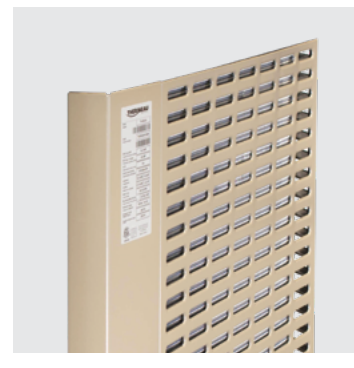
Removable protective grille for easy cleaning and maintenance.