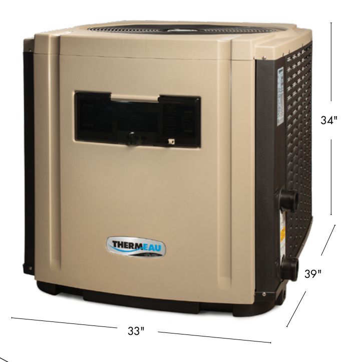
Two-inch union at the front of the heat pump for easy installation.