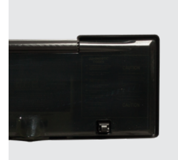
Lockable panel that secures the system's configuration and protects it from bad weather