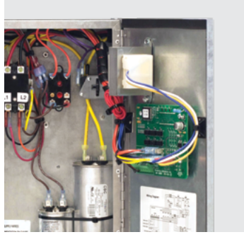
Electronic temperature control with auto-diagnostic features