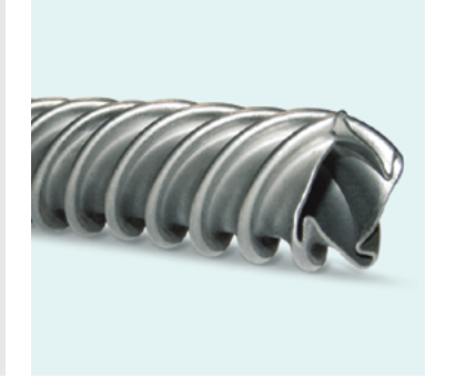
Rifled titanium tube increases the exchange surface for better heat transfer. Extremely robust, it withstands the pool's chemical products.