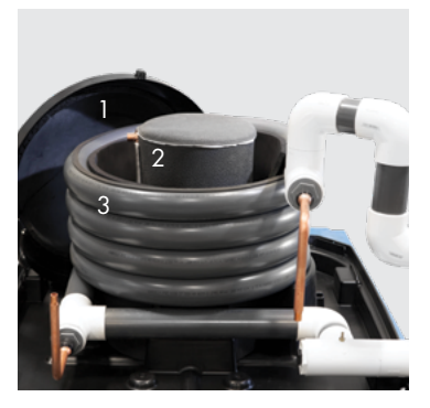
Ultra-silent pool heating thanks to its triple-action sound barrier system .