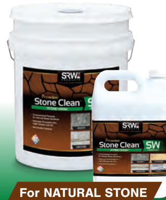
For NATURAL STONE