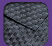
*FRONT AND BACK DETAIL