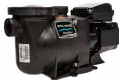
SuperMax High Performance Pump

Known for high performance, energy smarts, easy upkeep, and proven reliability.