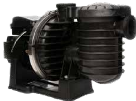
Max-E-Pro High Efficiency Pool Pump