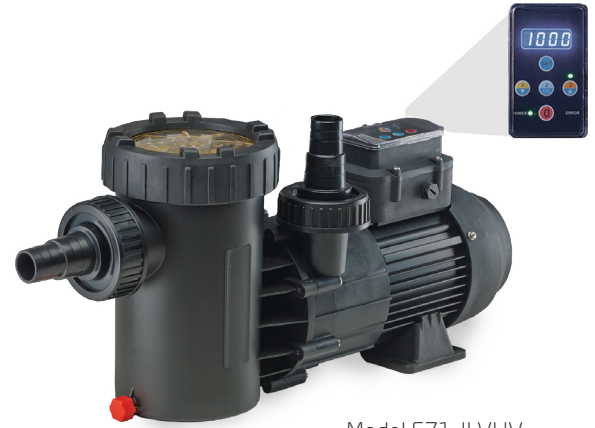
Model E71-II VHV