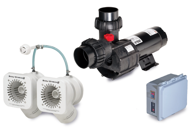
Package A (with square cover)