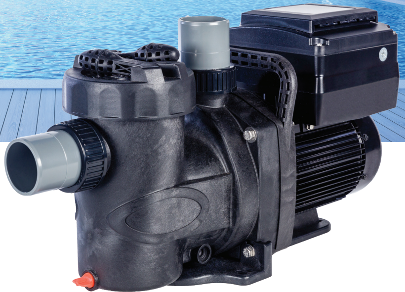
BADU ® Pro-V UVS (2.7THP) (WEF: 7.766, HHP: 1.405)