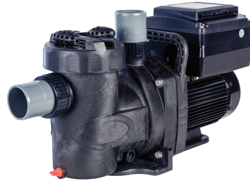
BADU Pro-III UVS