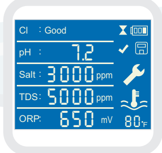
Read the digital display