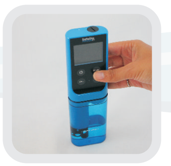
Press ON and then press START