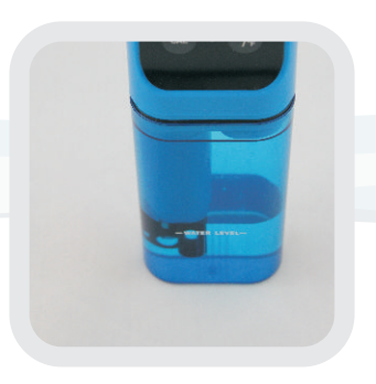
Place the sensors into water sample