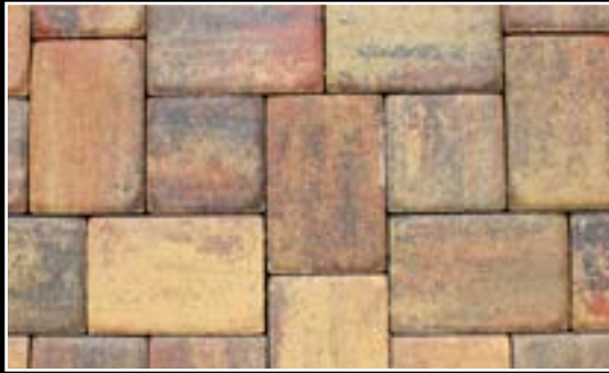
Old San Juan