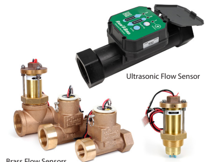
Brass Flow Sensors

Surge protection (FSSURGEKIT) is recommended for most systems - One at the Flow Sensor, and if more than 50' of wire run, one at the Pulse Transmitter. FSSURGEKIT is not required for Two-Wire Decoder Systems and not compatible with the ESP-LXMEF Flow Smart Module.