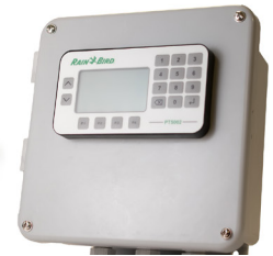
PT5002 & Enclosure