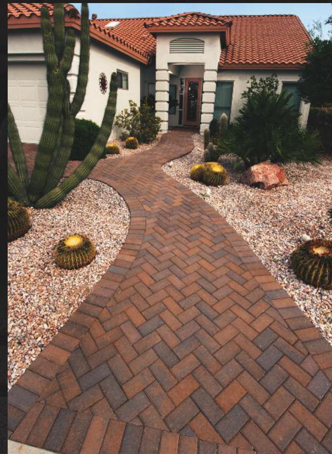
Holland Paver, Native

Holland Paver Size, classic mitered edge 4 1/8 x 8 1/4 inches 2 3/8 thick standard, optional 3 1/8 thick