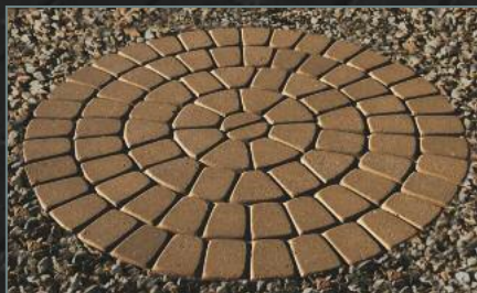
above: Circle Kit, Tan custom color

Each circle requires one 4' diameter kit. (covering 15 sqft) The remainder is built with standard pavers.