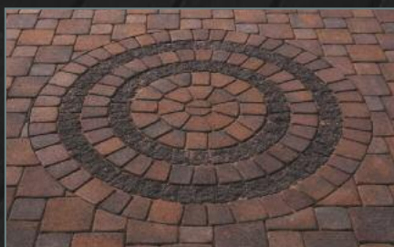
above: Native with Antique Pavers in black