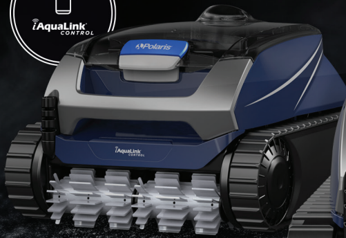
EPIC 8642 iQ