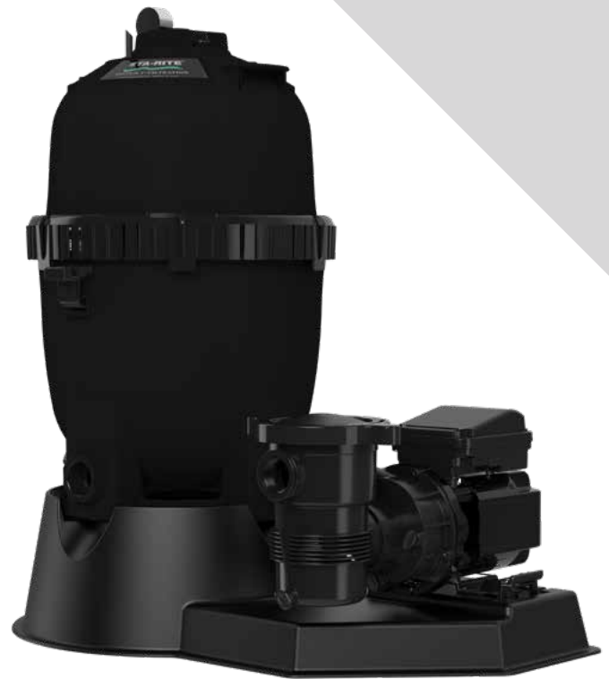
SYSTEM:2 MOD MEDIA PLM SERIES ABOVEGROUND SYSTEMS