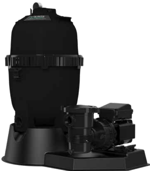
SYSTEM:2 MOD MEDIA PLM SERIES ABOVEGROUND SYSTEMS