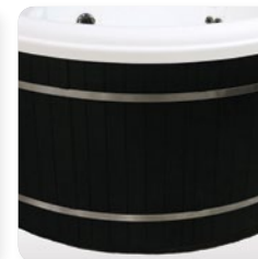
Stainless Steel Banding (only available on round models)