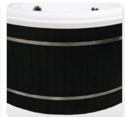
Stainless Steel Banding (only available on round models)