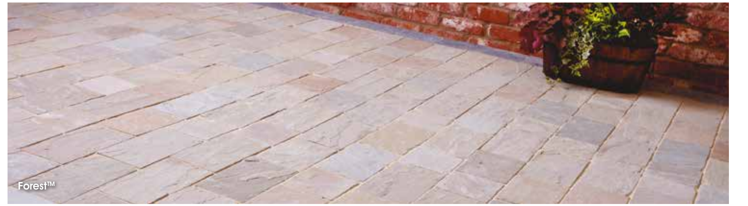
See page 38 for laying patterns.