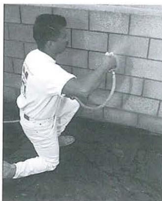
Moisten substrate with clean water.