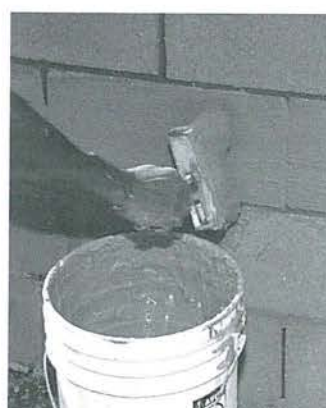
Apply with long horizontal strokes.