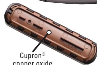
Cupron ® copper oxide