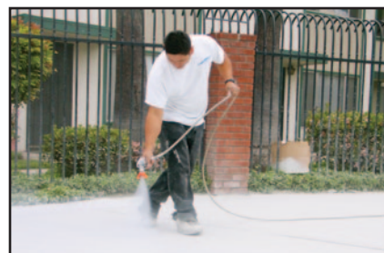
SECOND COAT (FULL STRENGTH COAT) CAN BE APPLIED BY AIRLESS SPRAYER OR ROLLER.