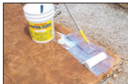
CLEARSEAL GOES ON WHITE AND DRIES TO A CLEAR FILM IN MINUTES. CAN BE ROLLED OR SPRAYED.