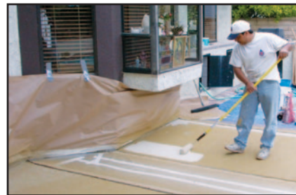
APPLY DILUTED FIRST COAT OF ACRATHANE COLORSEAL WITH ROLLER.