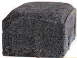
1.77 inches 45 mm

5½ x 8¼", 5½ x 5½", 2¾ x 5½" all pavers 45mm thick