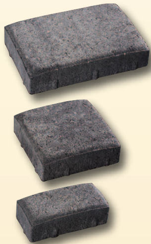
Sold as 3 piece combo