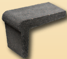
Veneer Coping See Veneer Coping Page