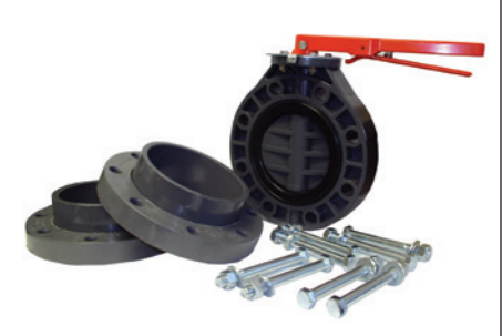
Also available as Contractor Kit, which includes flanges and bolt set. See List Price Sheet for details.

Caution: Colonial recommends a minimum installation distance of 10 X the pipe diameter from a pump or other sources of turbulence.