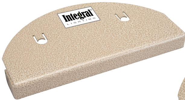
IL600.780.550 Light Concrete finish shown