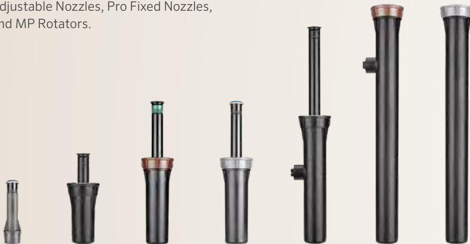
Shown here: PRS40 shrub, Pro-Spray 2", PRS30 and PRS40 4", Pro-Spray 6", and PRS30 and PRS40 12" sprays

All models also include a user-friendly pull-ring flush cap to keep debris and clogging to a minimum. In addition, the Hunter Pro-Spray sprinkler head is compatible with all industry standard female nozzles, offering a high degree of flexibility.