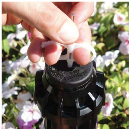
I-20 can be turned off at the head if needed

I-20-12 Overall Height: 17" Pop-up Height: 12" Exposed Diameter: 1¾" Inlet Size: ¾" female NPT