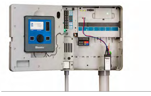
Metal Wall Mount (gray or stainless)