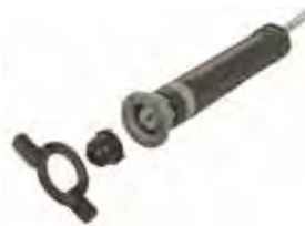
Installation Tool Included SKU #SP0536CTOOL