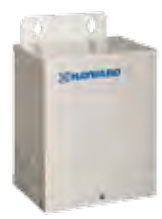
Wall Mount Transformer