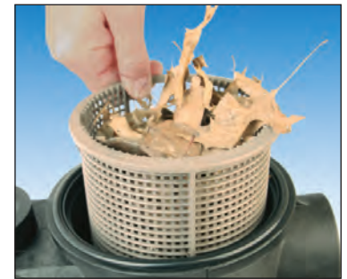
Super II 155-Cubic-Inch (2500cc) Basket

is more like a bucket. The Super II Pump Series features impressive leaf-holding capacity. Rigid construction includes load-extender ribbing for free-flowing operation, even under extra-heavy debris loads.