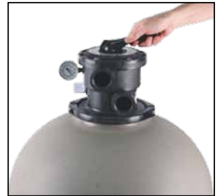
Vari-Flo™ 7-Position Control Valve with easy-to-use lever-action handle lets you "dial" any of seven valve/filter functions.