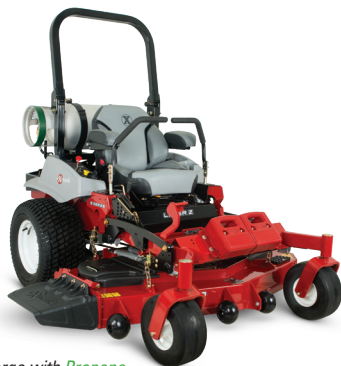
Side Discharge with Propane