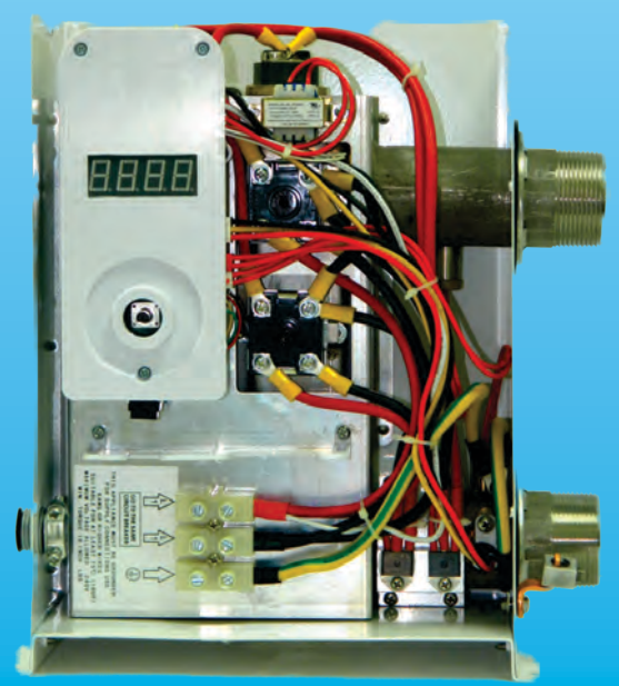
Interior View of Smart SPA 11