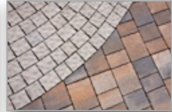
Concrete & Masonry