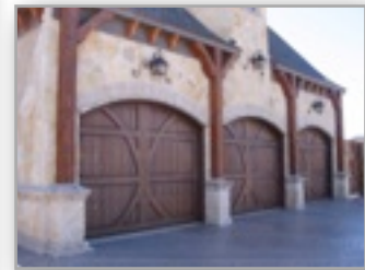
Decorative Wood Trim

SealBack™ is a water-based clear acrylic sealer that provides years of protection when applied to wood, concrete, and plastic surfaces. SealBack™ is uniquely formulated to prevent fading and to self-clean. SealBack™ dries clear, but can be tinted to any color by adding 4 oz. of the desired stain or dye to the one gallon container.