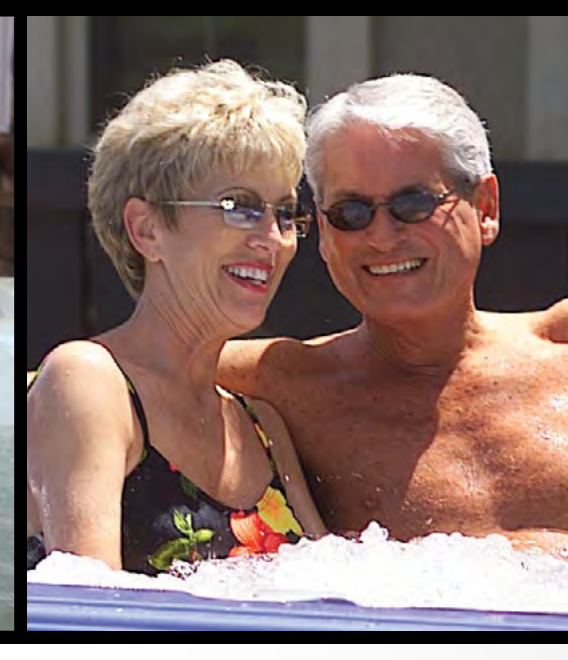
Your Authorized Garden Leisure Swim Spa Dealer