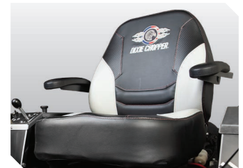
Comfort Ride - Plush cushioned seat with armrests for extra comfort