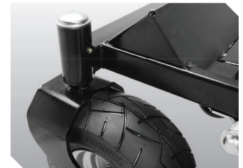
Commercial Forks - Greaseable and lifetime warranty against breakage