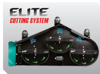
42", 48", & 54" Elite Cutting System - Formed and welded 10-ga deck shell