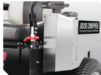
Stainless Steel - Protects fuel tank from sun and impact damage