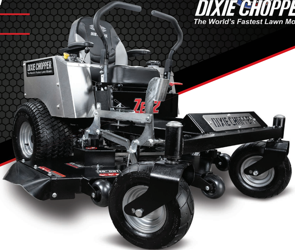
Zee 2 - 2348KW model shown*