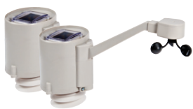
WWS, WWSE wireless weather station (optional)