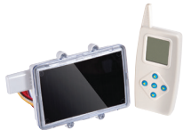
LEIT-2ET 2 station smart, wireless

NOTE: One handset can be used for up to 99 controllers or 198 valves.