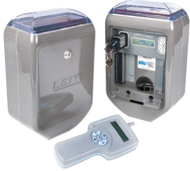
LEIT X & XRC 4-28 stations