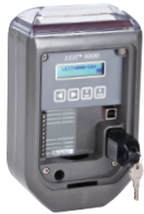
LEIT 4000 4-8 stations

Select a controller below then choose the number of solenoids or valve combinations based upon station requirements. Be sure to include a