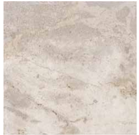
S9TS01 • HTS201 BEIGE 24x24 in 60x60 cm