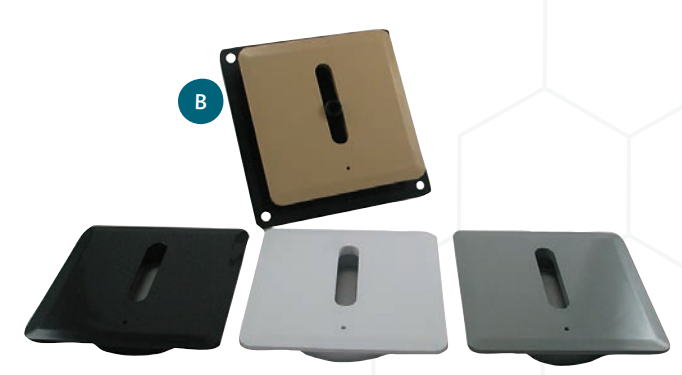
Adjustable Wall Jet Patent #8,366,016