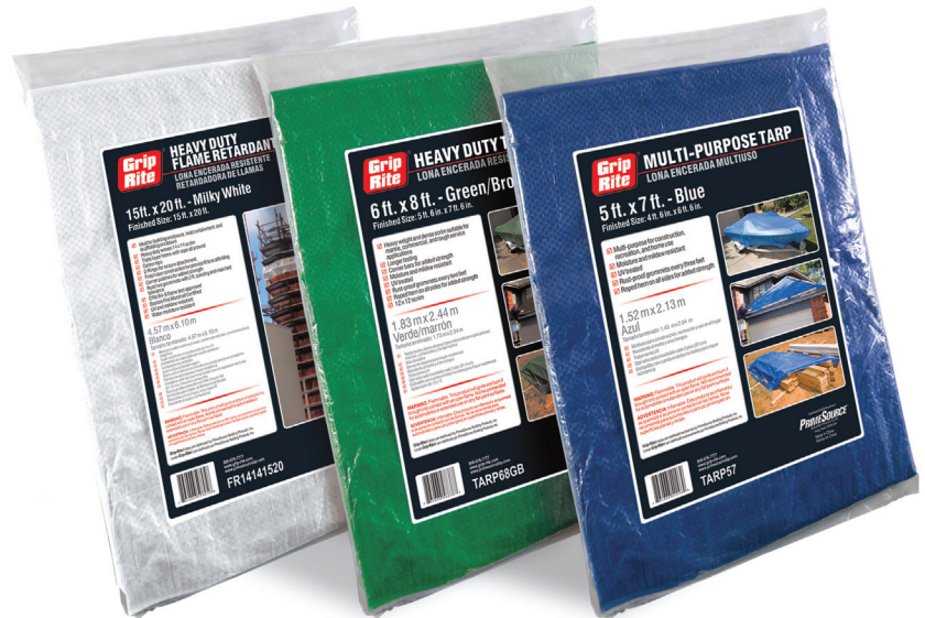
FR14141520 Heavy Duty Flame Retardant 15 ft. x 20 ft. - Milky White