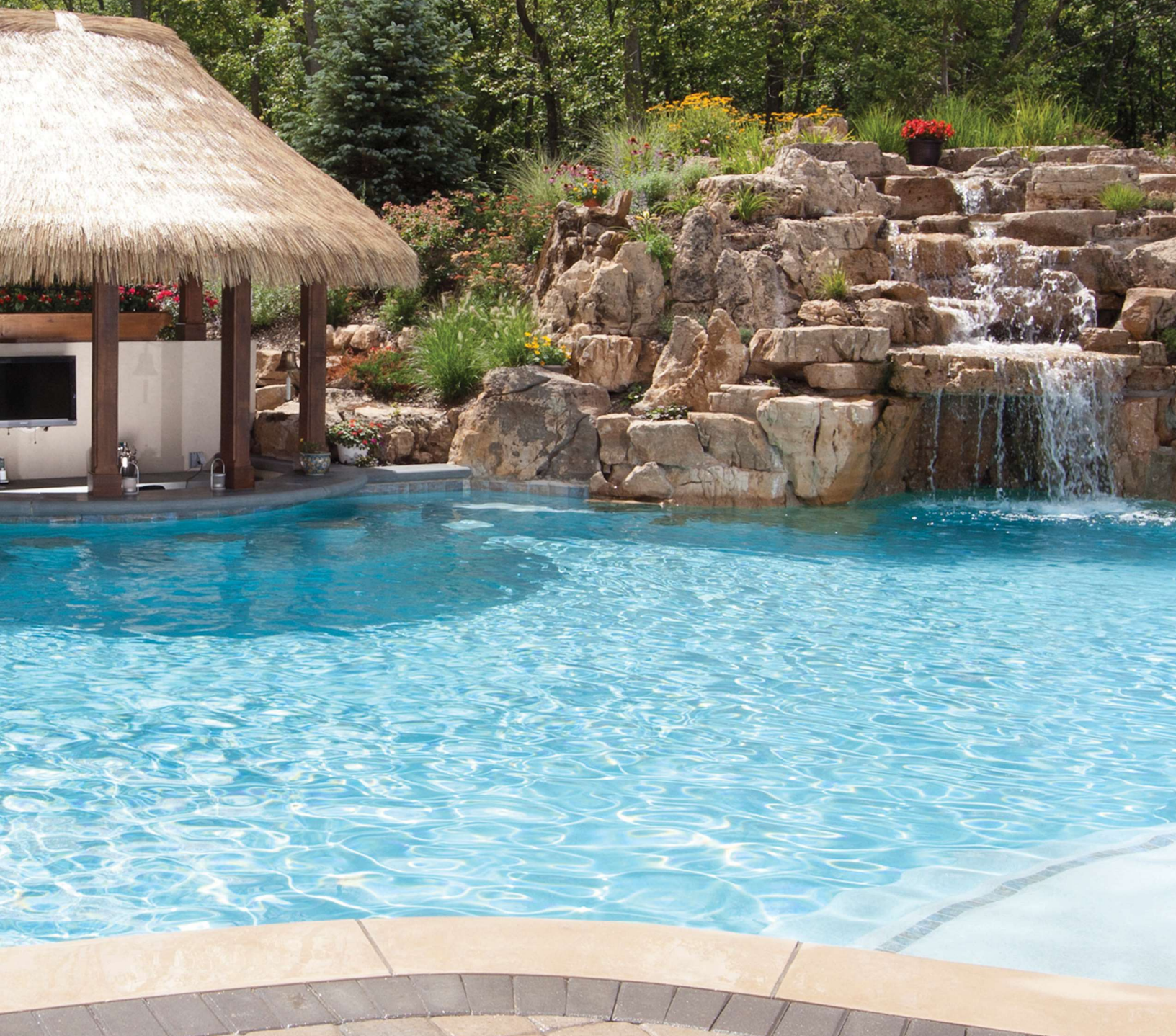
Krystalkrete Super Blue

Actual CL Industries' finish and water color may differ from digitally photographed and reproduced samples. CL Industries strongly recommends viewing actual swimming pools in person before deciding on a color.