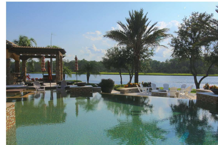
CrystalStones Natural Sandy Beach