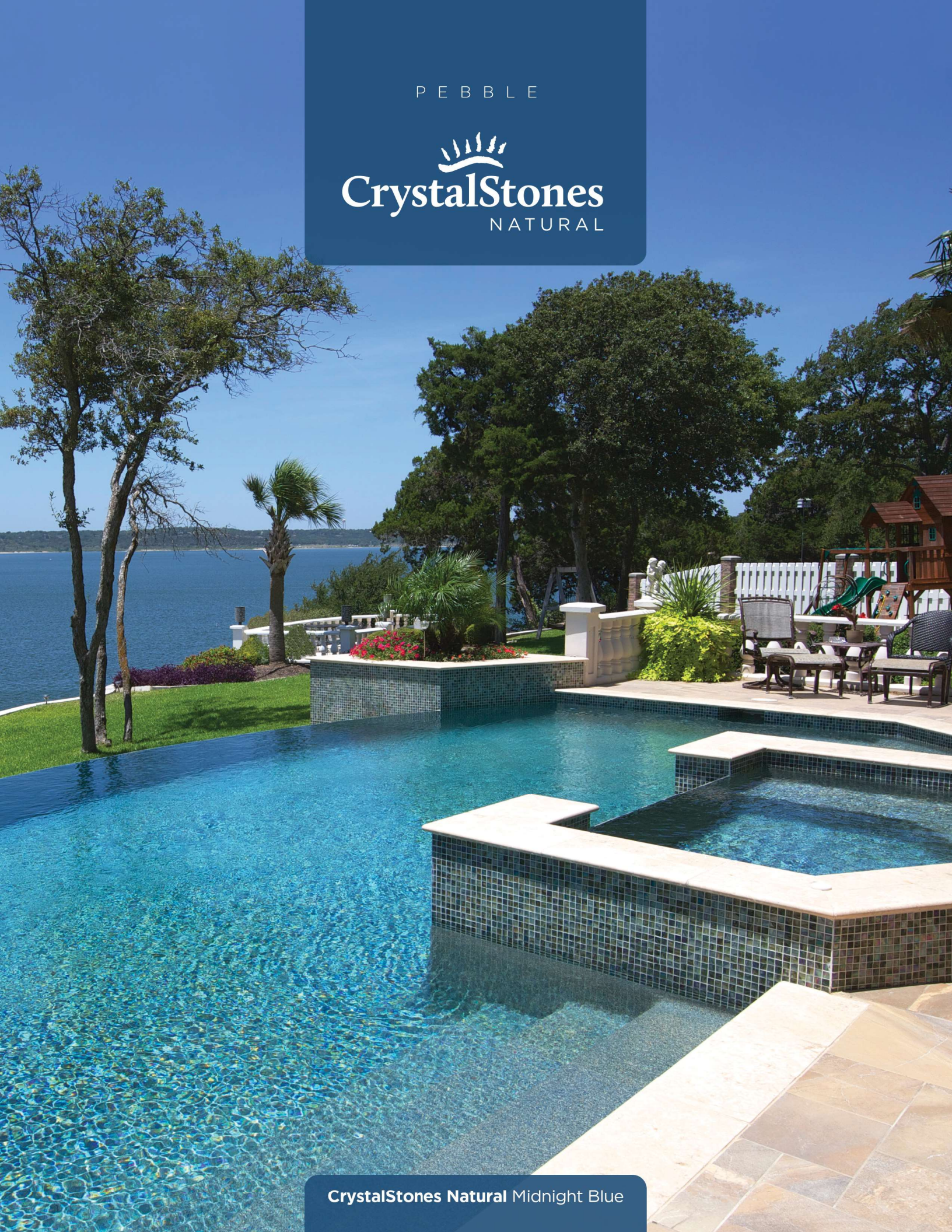
CrystalStones Natural Midnight Blue