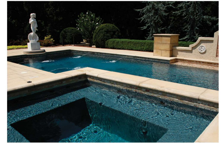
Hydrazzo Mediterranean Blue