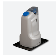
pH/Cl CHEMICAL FEED SYSTEMS