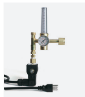
CO 2 FEEDER