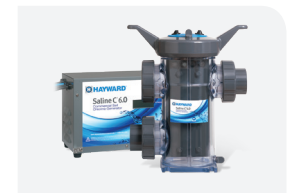
SALINE C® SYSTEM

*Standard Package includes Molded Flow Cell and Float-Style Flow Sensor