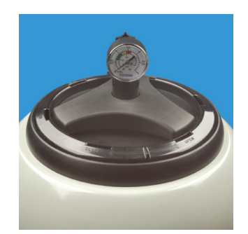
The Aster Series filter is the only filter in the market that comes standard with a unique patented tool-less lid systems. The AstralPool Toolless lid system is made from commercial grade quality materials that compresses the o-ring against the lid collar for a water tight seal.