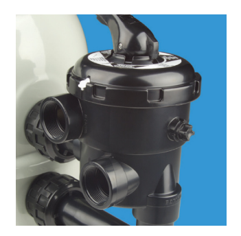
All Aster Series filter can be equipped with a manifold system or a mutliport valve. AstralPool Multiport valves utilize a tool-less lid system that allows for easy access to internal components.