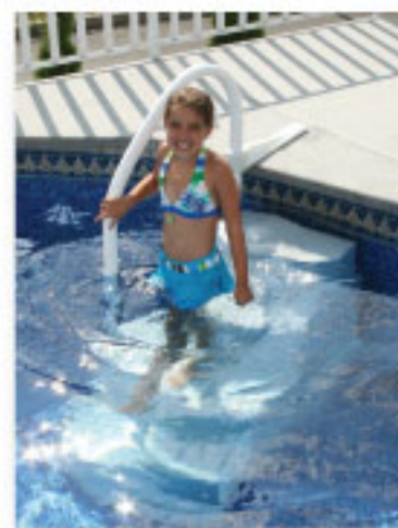
Duke step shown in White Granite