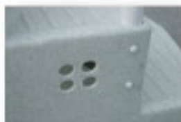
Port holes allow water to circulate through staircase.