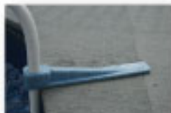
Resin flange secures step to deck.