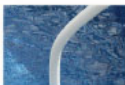
No Maintenance White PVC Rail