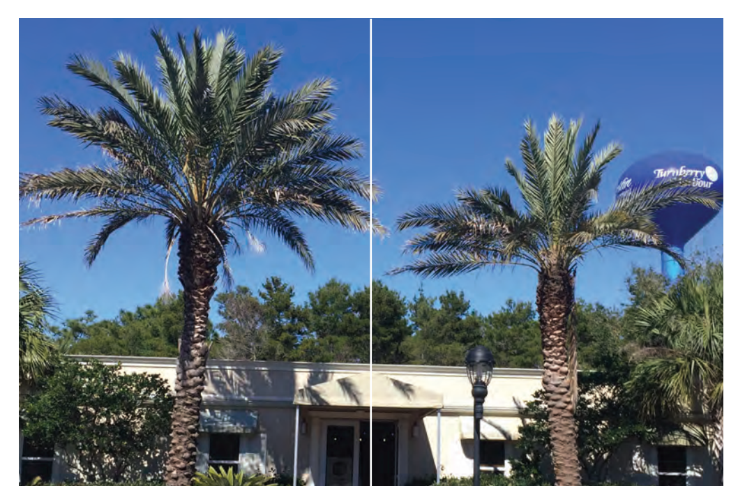
16 months after PALM-jet Mg treatment

These photos were taken 16 months after treatment, with a treatment rate of 20ml of PALM-jet Mg. The treated palm (on left) exhibited a much healthier, vibrant canopy than the untreated palm (on right). Palms can be treated throughout the growing season.