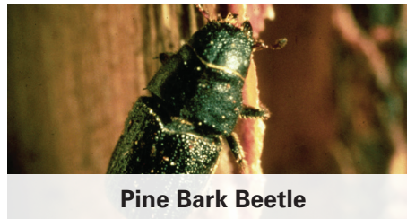
Pine Bark Beetle