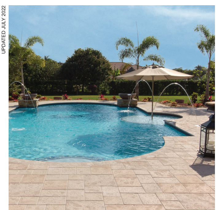
COLOR SELECTION - PAVERS AND COPING