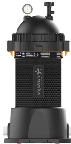
Model # PLF27000