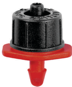
CETA ® PC 1/2 gph Barb 0.16"