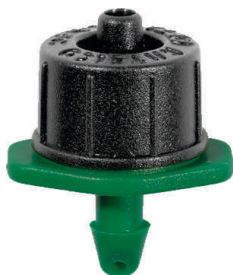
CETA ® PC 2 gph Barb 0.16"