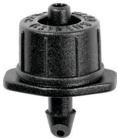
CETA ® PC 1 gph Barb 0.16"