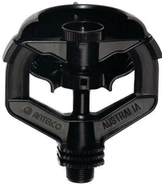
180° Deflector fitted